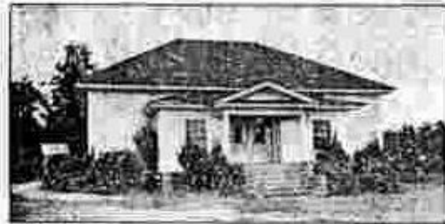
Original Brushy Creek Elementary School 1916

Brushy Creek Elementary School has a long history of excellence in education, care and concern for students, and a strong involvement with the community. The first Brushy Creek School building was built in 1916. It was a four-room structure and stood across Brushy Creek Road from the present day building. Early on, quiet fields and busy farms surrounded the school. Across the street was Brushy Creek Baptist Church; distinguished for being the oldest church in Greenville County. Up the road was the prosperous and progressive Silverleaf Dairy.